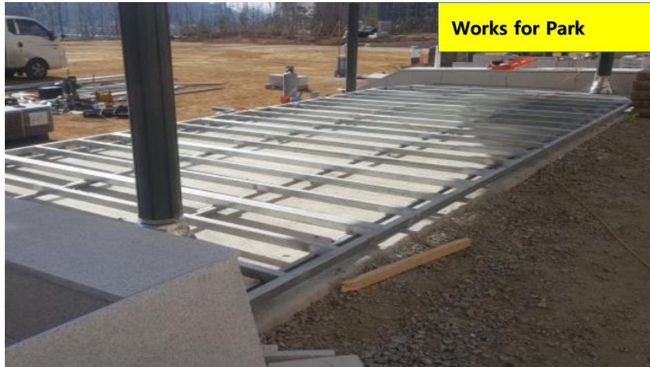
Works for Park