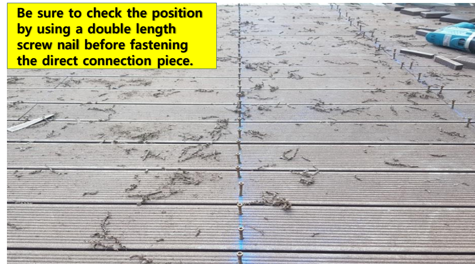
Be sure to check the position by using a double length screw nail before fastening the direct connection piece.