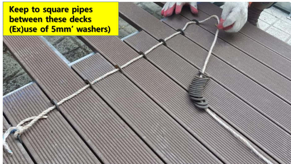
Keep to square pipes between these decks (Ex)use of 5mm' washers)