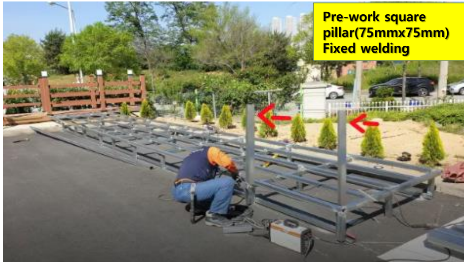
Pre-work square pillar(75mmx75mm) Fixed welding