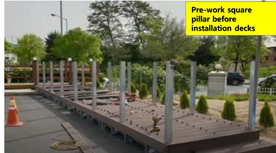
Pre-work square pillar before installation decks