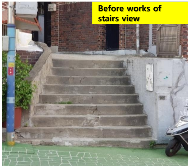
Before works of stairs view