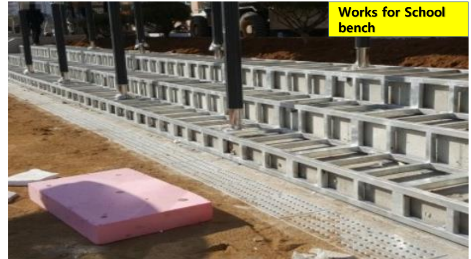
Works for School bench